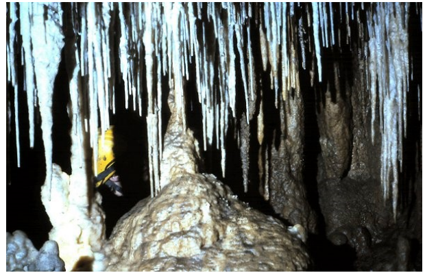
Sloans Valley Preserve