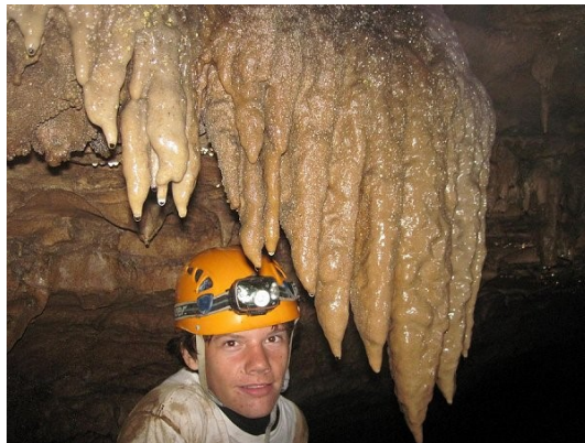
Misty Cave Preserve