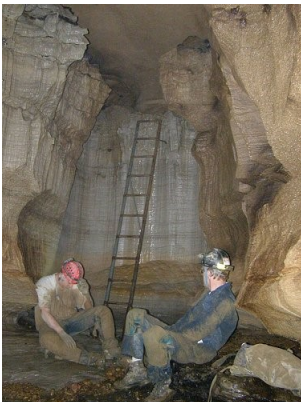
Cornhole Cave Preserve