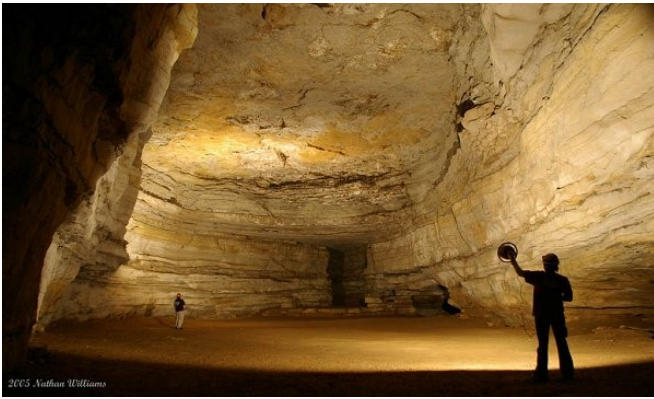
Great Saltpetre Cave Preserve